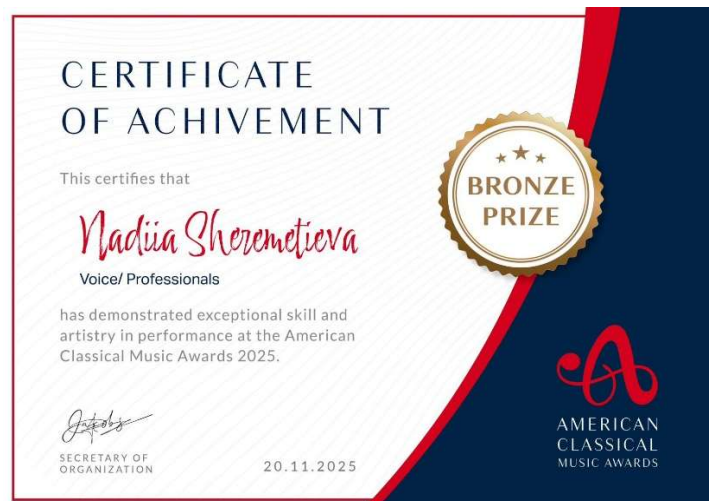
3rd Prize American Classical Music Award 2025