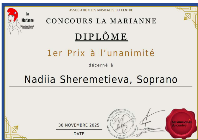
1st Prize „à l'unanimité“ Concours La Marianne 2025, Paris