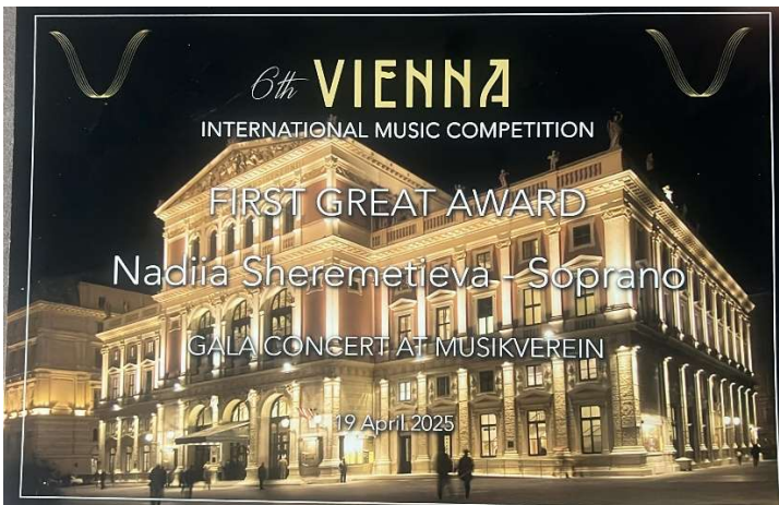
1st Prize Vienna International Music Competition 2025