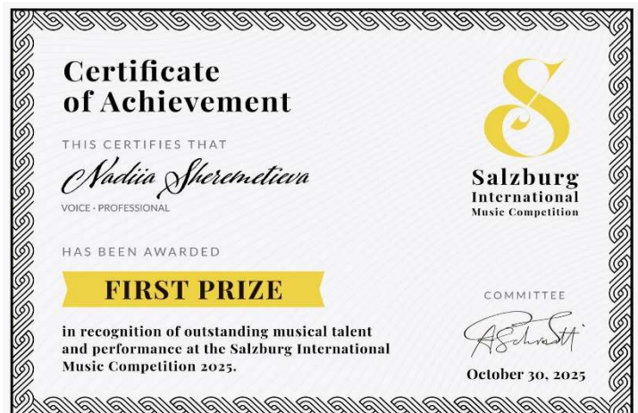
1st Prize Salzburg Int. Music Competition 2025