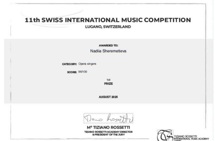
1st Prize Swiss International Music Competition 2025