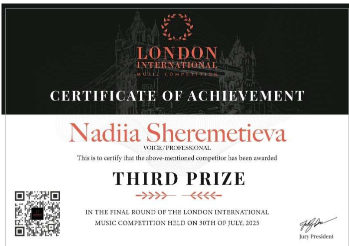
3rd Prize London International Music Competition 2025